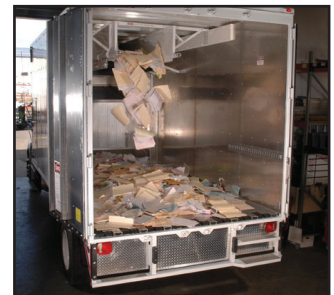
PAPER SHREDDING SOLUTIONS