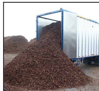
WOOD & EARTH SOLUTIONS