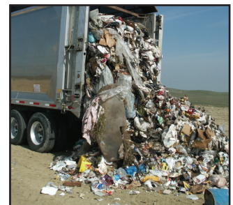
WASTE & RECYCLING SOLUTIONS