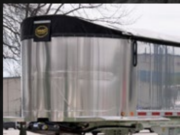
Optional tapered 84" to 90" front to back wedge body design