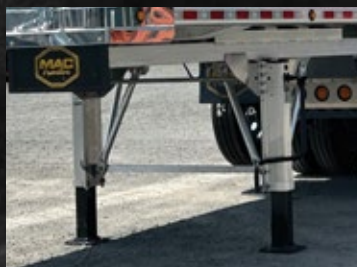
Jost AX150 Landing Gear