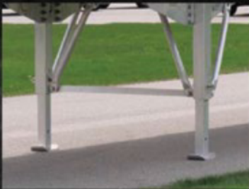
Jost AX150 Landing Gear