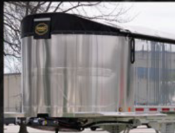
Optional tapered 84" to 90" front to back wedge body design