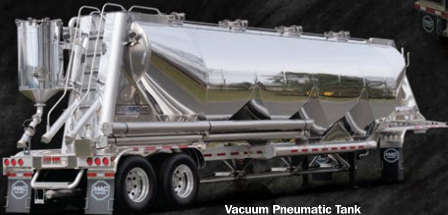
Vacuum Pneumatic Tank