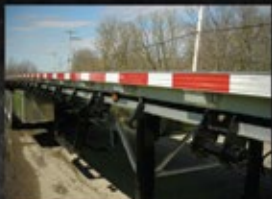
Western Side Rail with Fixed Angle Winches and Fixed Strap Hooks