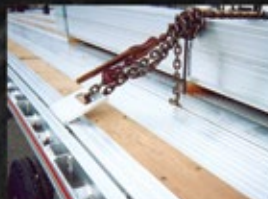
J-Hook Tie Down 7900 lb working load limit