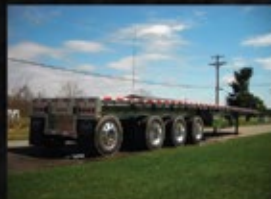
Quad Axle Steerable Rear Axle