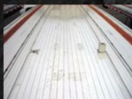
Coil Well with Deck Pockets