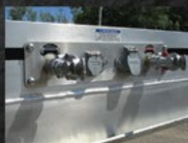
Removable Access Panel