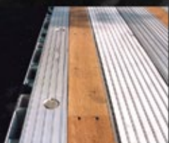
Chain Sleeve Tie Down