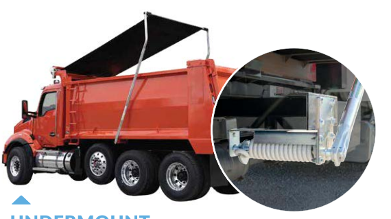
UNDERMOUNT DUMP BODIES AND TRAILERS UP TO 42'

Industry's strongest, most reliable, and longest lasting spring assembly